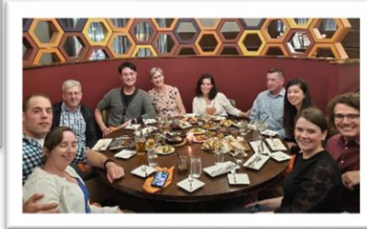
ASEPA members, ENDO 2023