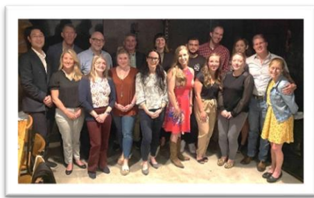
ASEPA members, AAPA 2023

We are looking for volunteers for the Newsletter and Social Media/Web committee. Those interested can reach out to: asepaemail@gmail.com